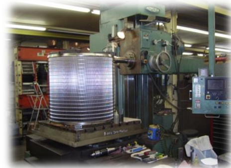
Milling a Filter/ Strainer in Numora Horizontal Boring Mill