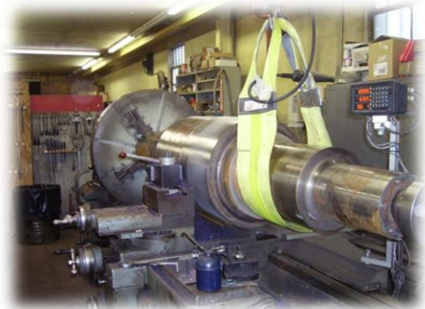
Large Shaft in Leblond Lathe