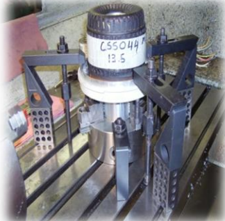
Stator Assembly in CNC Vertical Mill