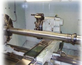
Shaft in Milltronics CNC Lathe